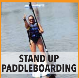
STAND UP PADDLEBOARDING