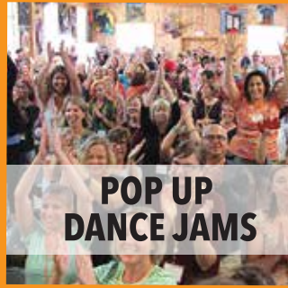
POP UP DANCE JAMS